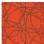
Dark green 44 Orange 28