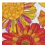
Breezy Blooms 691 multi 09 Fabric B: 1 1/8 yards