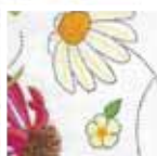
Breezy Blooms Toss 692 multi 09 Fabric C: 3/8 yard