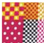
Check Dot Plaid 693 multi 99 Fabric G: 3 3/4 yards Backing