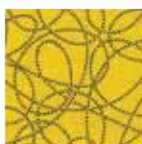
Scribble Dot - 695 Fabric D: 1/3 yard or FQ Dark Pink 26 Yellow 33