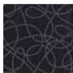
Scribble Dot 695 Black 12 Fabric E: 2 3/4 yards Sashing, part of backing & binding