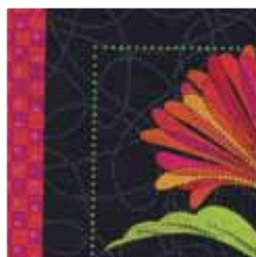
Garden Patch Panel 690 multi 99 Fabric A: Six full panel squares & borders Approx. 1-1 1/2 yards

Susan Rooney's Breezy Blooms fabric collection designed for Benartex Inc.